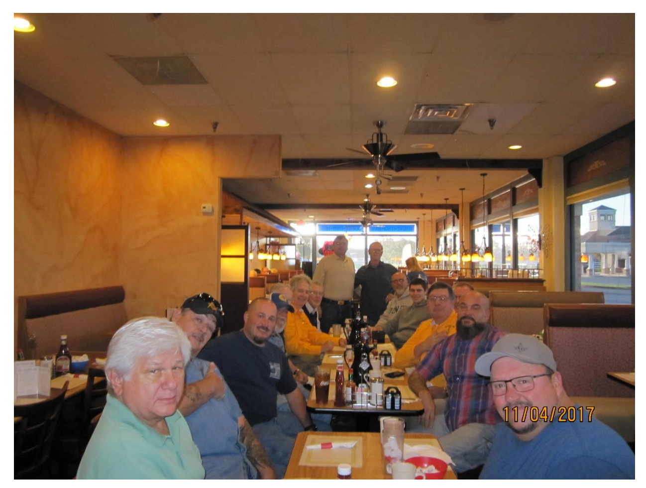
Breakfast with the Guys